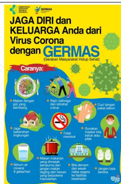
Fig. 3. Covid 19 health protocols poster.