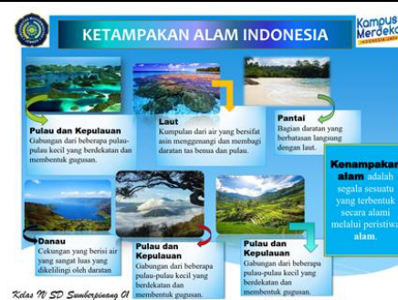
Fig. 5. Natural scenery poster.