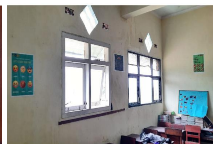
Fig. 8. Elementary school students are looking at poster.