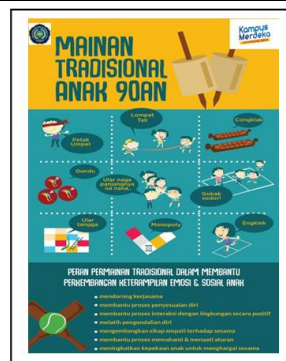
Fig. 4. Traditional Toy Poster.