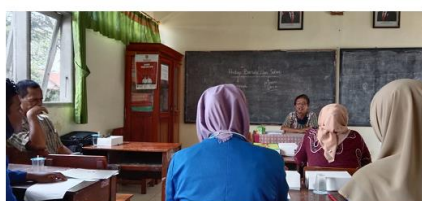
Fig. 1. Meeting with headdmaster, all teachers, and college student.