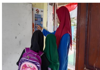
Fig. 7. Classroom condition after stucked the posters.